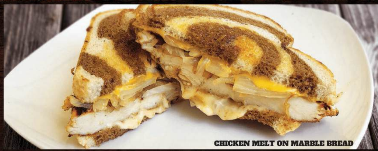
CHICKEN MELT ON MARBLE BREAD

Topped with lettuce, tomatoes and mozzarella cheese on a brioche bun 13