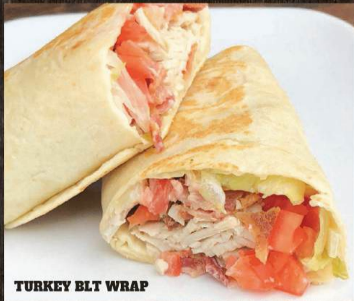
TURKEY BLT WRAP

Chicken salad topped with dried cherries, spinach and candy coated pecans. Served with a side of raspberry vinaigrette 13