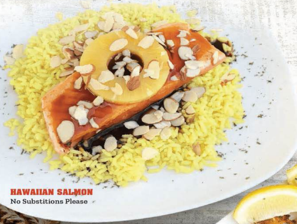
HAWAIIAN SALMON No Substitutions Please